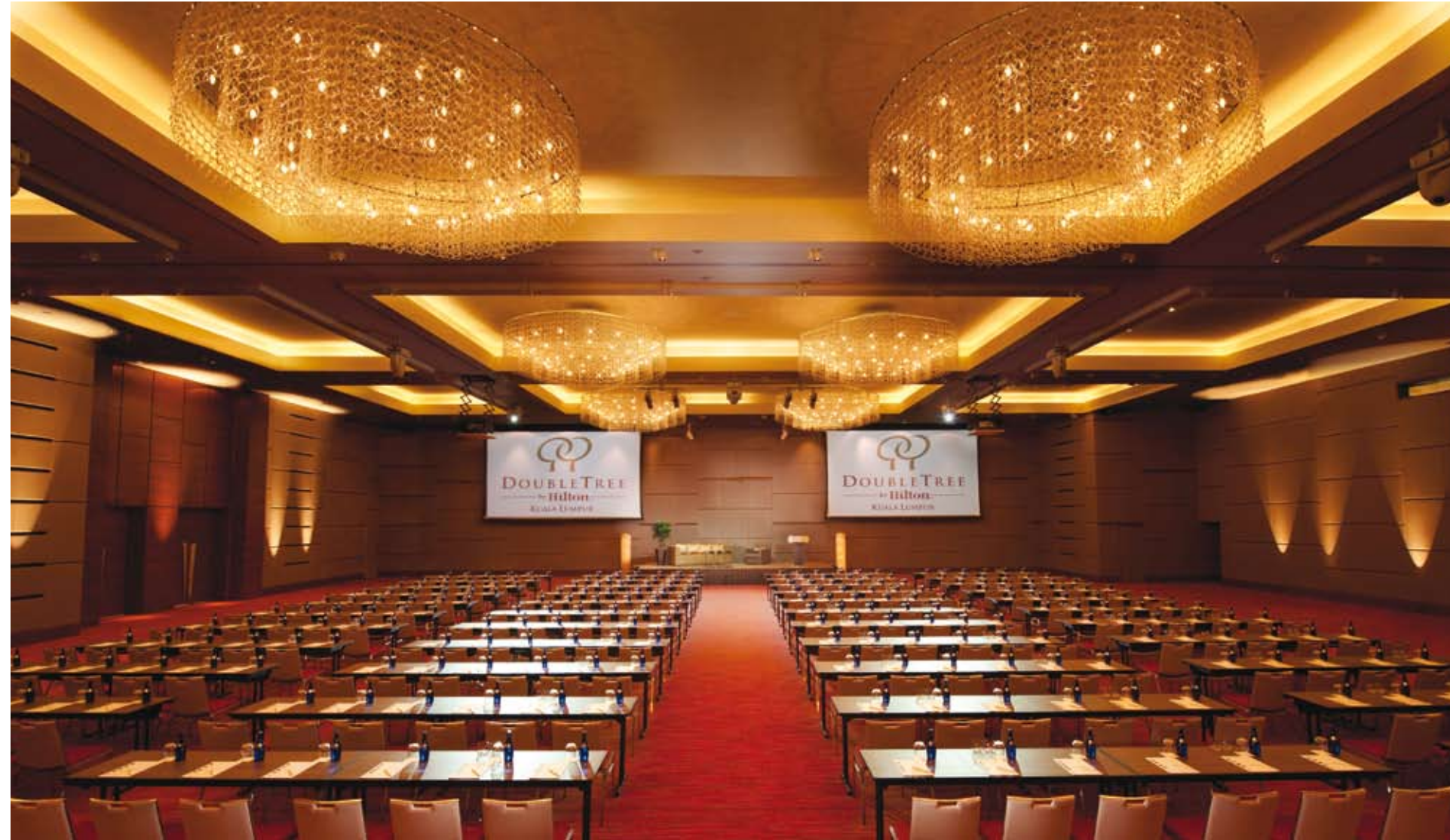
An ideal venue for meetings, conferences, large corporate and private functions