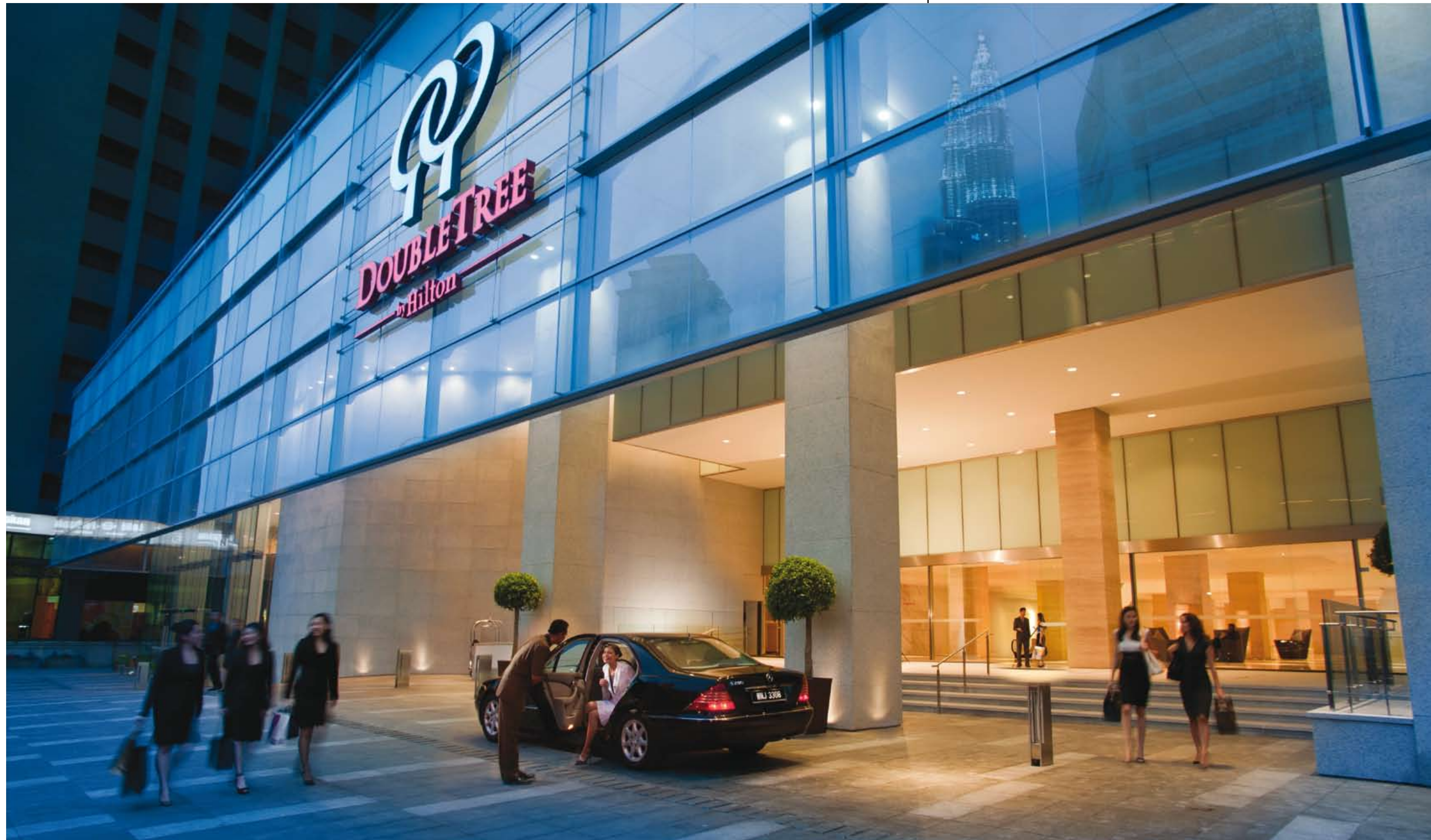
Doubletree by Hilton Hotel